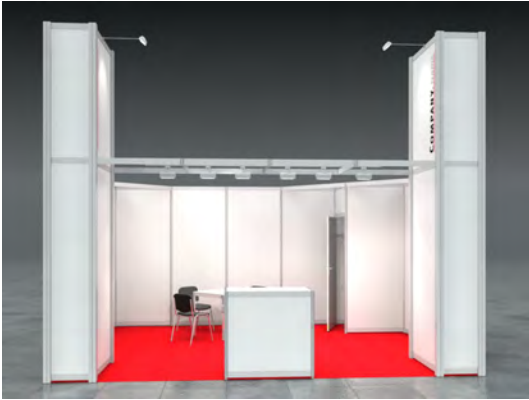
Example: 20sqm row stand

We hereby order a rental stand LUCY according to our stand size.