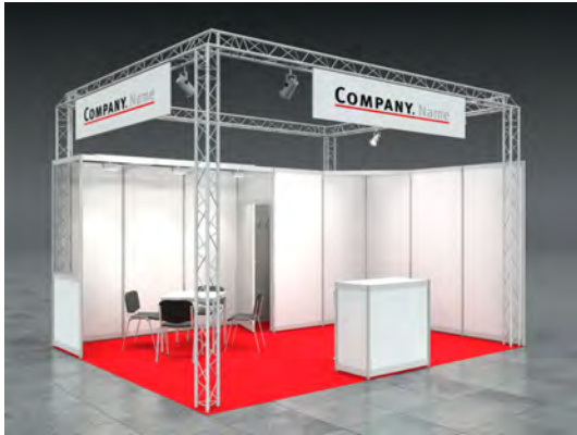
Example: 20sqm corner stand